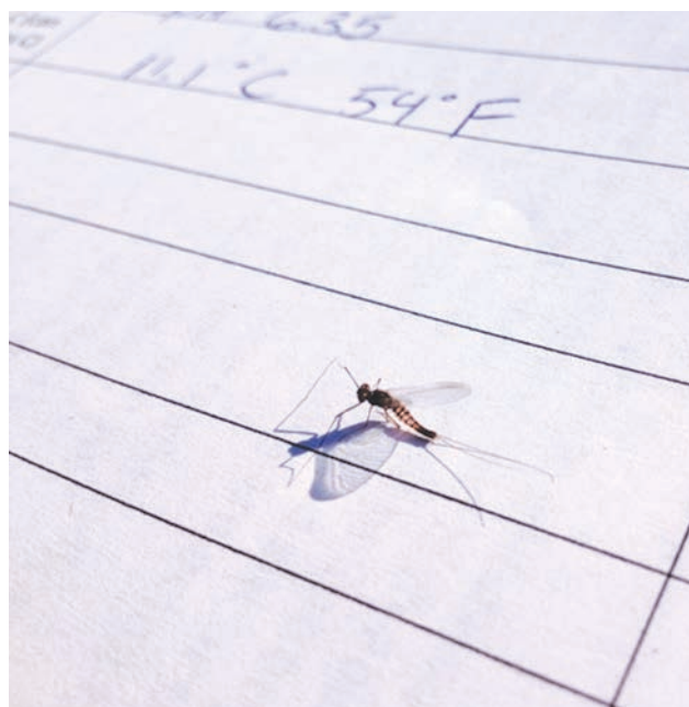
Collecting data in the field with a mayfly.