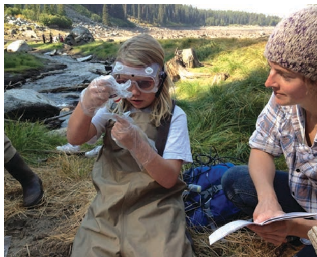
Students collect data from Boulder Creek. A student and graduate student sit at the mouth of Boulder Creek.